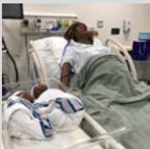
(above) Yale Nursing's high-tech maternal and childbirth simulation center.