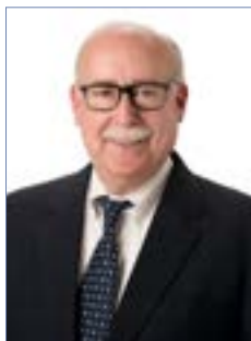
David Vlahov , urban health expert

That work often studies health equity, as the adverse health impacts of a changing climate are disproportionately borne by the poor. Partnerships with architects of the built environment and urban planners yields valuable insights about how physical activity, air quality, green space, and access to food and water transforms our health.