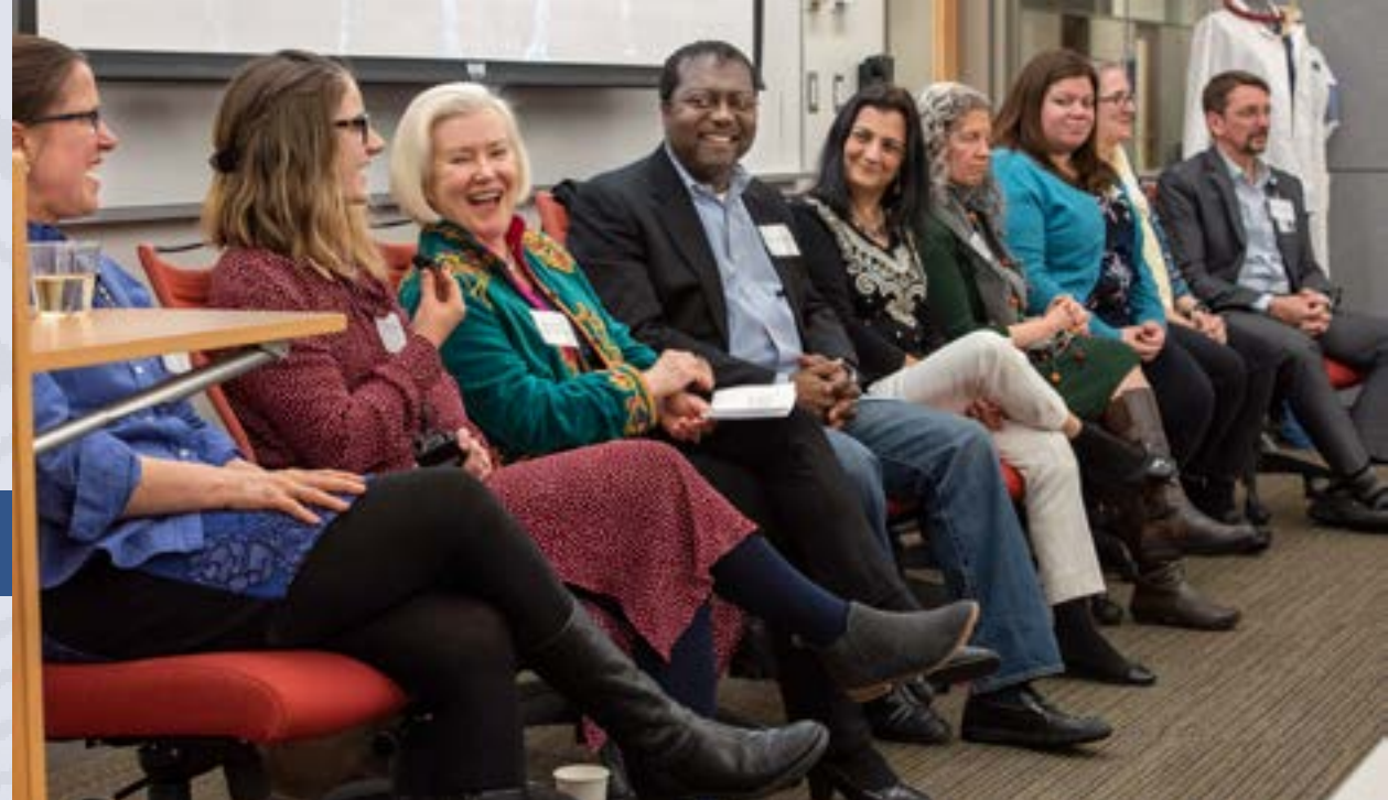
(above) A panel of alumni leaders convene to provide advice and expertise on transition to practice for graduating students.